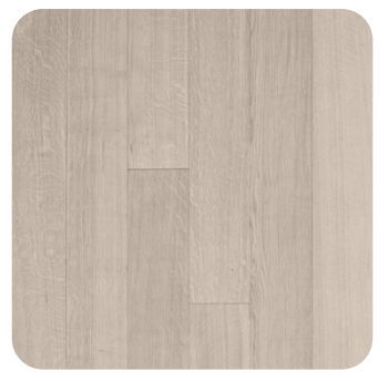
Rift & Quarter (R&Q)