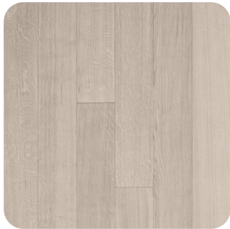
Rift & Quarter (R&Q)