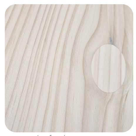
example of a plug